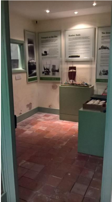
Entrance to Weighing Room showing floor surface