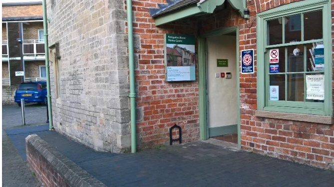
Ramp to side wheelchair entrance