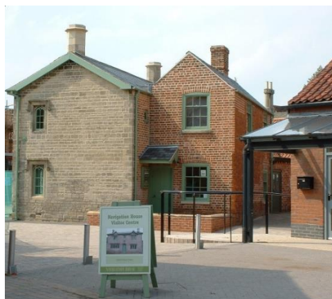
Wheelchair access via the side door.